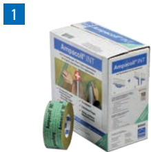
Ampacoll® INT: Acrylic adhesive tape