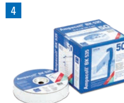
Ampacoll® BK 535: Nastro adesivo alla gomma butilica