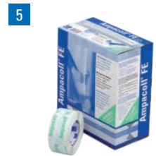
Ampacoll® FE: Butyl rubber adhesive tape