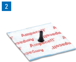
Ampacoll® Elektro u. Install: Sleeves