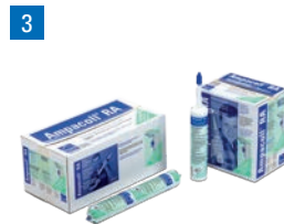
Ampacoll® RA: Liquid adhesive