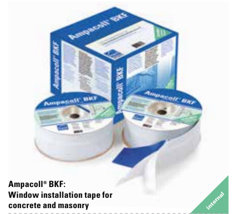
Ampacoll® BKF: Window installation tape for concrete and masonry