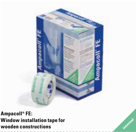
Ampacoll® FE: Window installation tape for wooden constructions