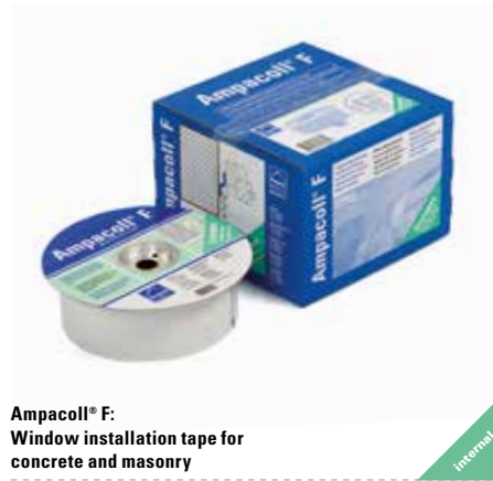
Ampacoll® F: Window installation tape for concrete and masonry