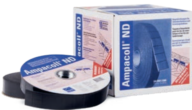
Ampacoll® ND 60: Nail seals, 60 mm wide