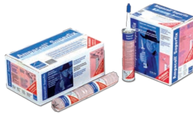
Ampacoll® Superfix For edge joints