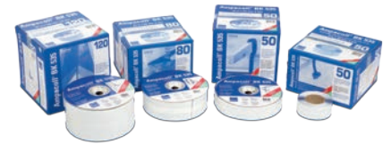
Ampacoll® BK 535 For penetrations