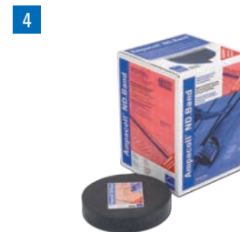
Ampacoll® ND.Band: Nail sealing tape