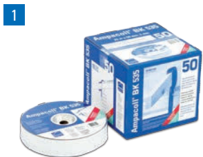
Ampacoll® BK 535: Butyl rubber adhesive tape