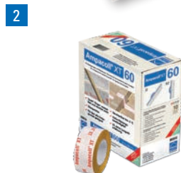
Ampacoll® XT 60: Acrylic adhesive tape