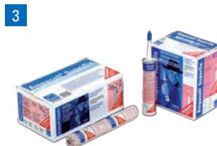
Ampacoll® Superfix: Liquid adhesive