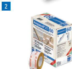
Ampacoll® XT 60: Acrylic adhesive tape