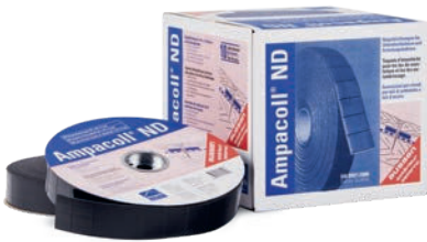
Ampacoll® ND 60: Nail seals, 60 mm wide