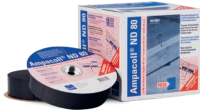
Ampacoll® ND 80: Nail seals, 80 mm wide