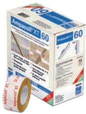
Ampacoll® XT For overlaps